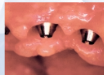
Sculptured papillas and soft tissue after healing.