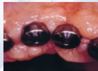
The ProHeal Caps in place.

For further information on the ProHeal Cap System, contact your local Astra Tech representative.